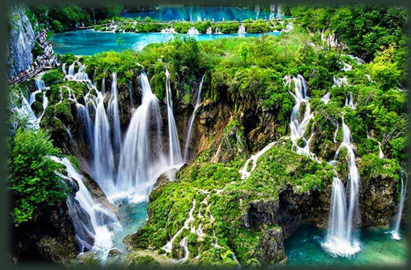
Plitvice Lakes National Park